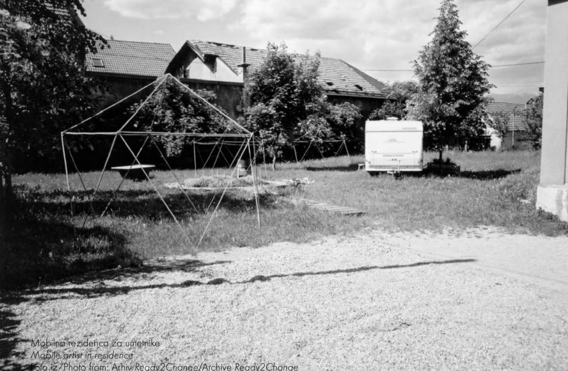
Mobilna rezidenca za umetnike Mobile artist in residence